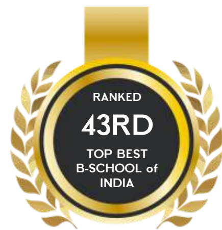
Fortune India 2025