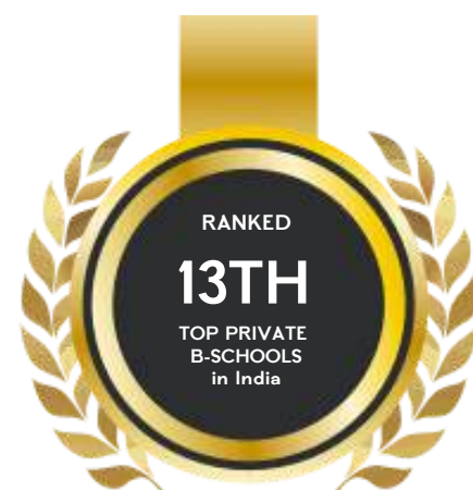
Outlook I-Care B School Survey 2026

Established in 2005, Symbiosis Institute of Operations Management (SIOM) is a distinguished institute with a niche focus on operations and supply chain management in Nashik, Maharashtra, India. Operating under the umbrella of Symbiosis International University, it has solidified its reputation as a highly regarded educational institution.