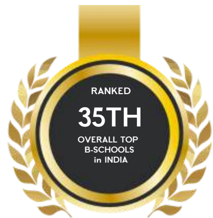
Business Today 2025