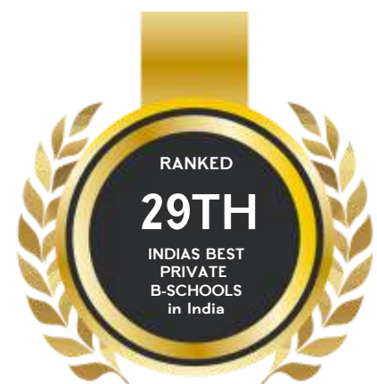
The Week Survey 2025